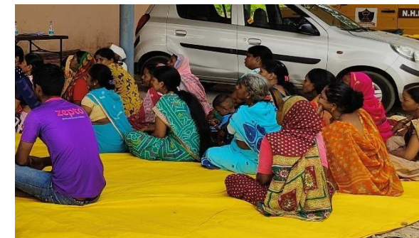
Field Base Assignment of URCD at Jambhali Village